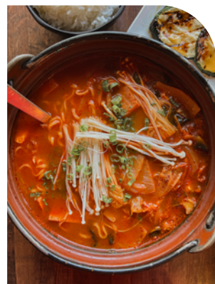
spicy kimchi hot pot

KOREAN ARMY POT | 17.95 korean spicy pot, based with shio with sausage, spam, tofu, cheese, onion and assorted vegetable