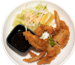
soft shell crab

SOFT SHELL CRAB | 9.95 panko crusted soft shell crab, served with shredded iceberg and ponzu sauce