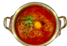
korean spicy ramen

add: spam +3, chicken +4, clam +4, black mussel +4, bay scallop +4, shrimp +5