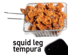
squid leg tempura