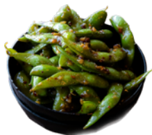
chili garlic edamame

EDAMAME | 3.95 GF V japanese boiled soybeans with salt