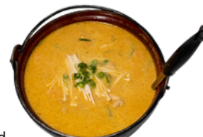
coconut chicken curry pot